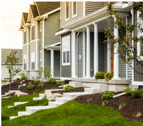
Photos are representative, not photos of Midpoint Meadows.